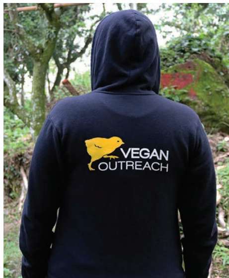
(Emmanuel in hoodie),  (chicks)