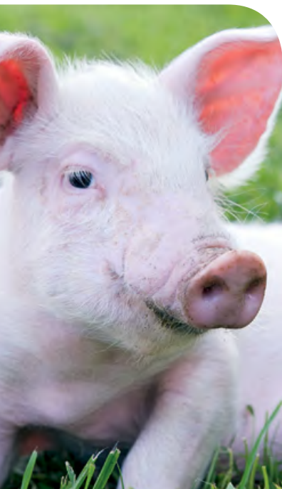
Kim Gordon, a rescued pig

In 2009, a farm worker in Pennsylvania found a pig named Emily (above) had figured out how to escape from her cage. But Emily wasn't content with her own freedom. She went around unlatching the doors of other cages. Coworkers said this happened often: when one pig learned to escape, she usually tried to show other pigs how to do the same.