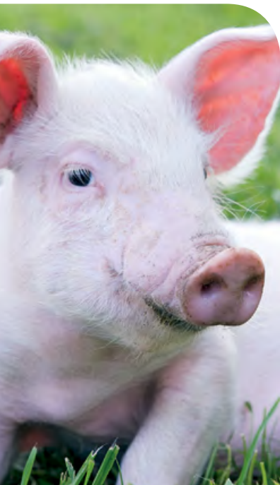
Kim Gordon, a rescued pig

In 2009, a farm worker in Pennsylvania found a pig named Emily (above) had figured out how to escape from her cage. But Emily wasn't content with her own freedom. She went around unlatching the doors of other cages. Coworkers said this happened often: when one pig learned to escape, she usually tried to show other pigs how to do the same.